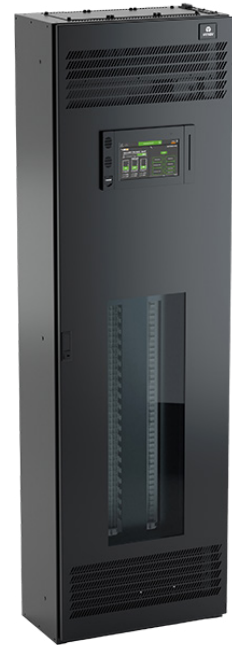
Vertiv™ Liebert® RXA Remote Power Distribution cabinet

Data centres are CapEx-intensive businesses, and 57 % of providers say construction costs are growing. EMEA is among the top 10 most expensive markets for building new facilities, with Zurich (#1), London (#5), Stockholm (#7) and Copenhagen (#8) leading the way. The average cost to build per MW is $20.6M and per m 2 is $30,800 – sums that are likely increasing with material and labour shortages. All of this is placing pressure on your data centre team to rationalise costs. Thus, your remote power panel needs to come with the lowest total cost of ownership , have a compact form factor, embedded metering system, and the fact that it's a packaged solution that's easy to install, maintain and add extra circuits to will achieve this goal.