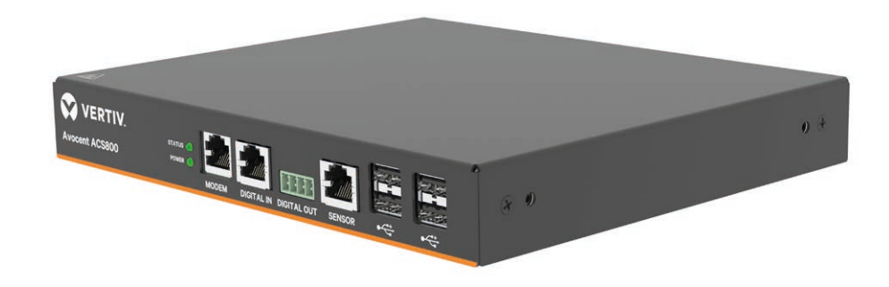
Avocent® ACS 800 Serial Console for the Edge

The Vertiv<sup>™</sup> Avocent<sup>®</sup> ACS 800 serial console system takes our renowned enterprise class technologies utilized in data centers around the world and packages the key features into an exciting compact and cost effective form factor.