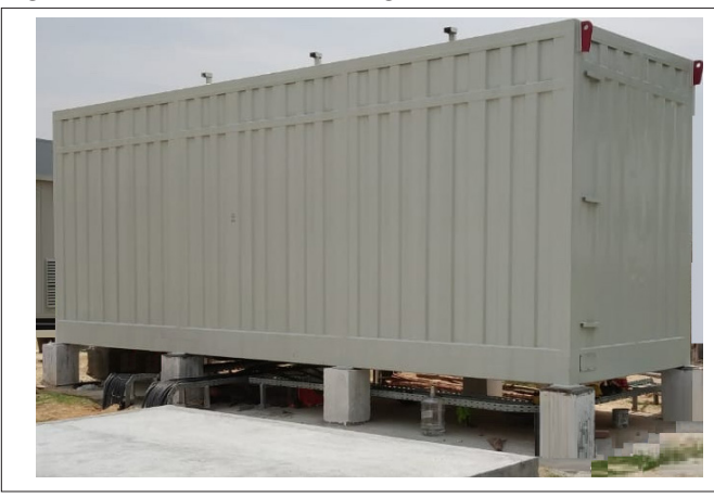
Fig 2: Vertiv® Thermal Management Solution for POWERGEAR'S Cubicles (E-Houses)