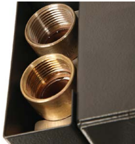
Top-of-rack water connections speed installation.