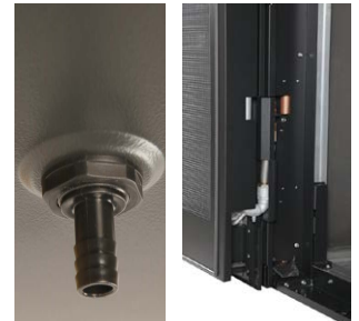
Condensation discharge supports Condensation pan.