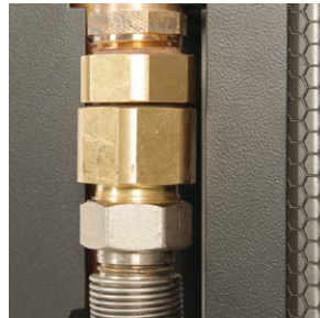
Highly reliable water-bearing hinge virtually eliminates the possibility of water leakage.