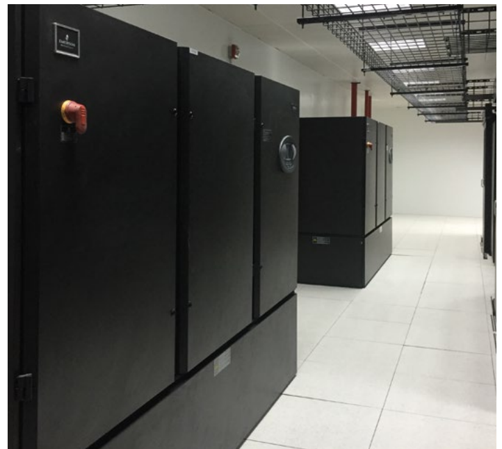
Vertiv equipment installed at the University of Dammam data center