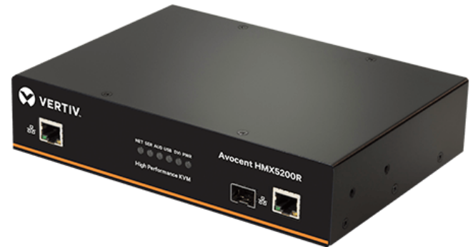
Avocent HMX 5000 Series

"The Avocent HMX 5000/6000 KVM is highly scalable and configurable, which makes it so easy to connect multiple users to multiple servers and workstations. It's really an ideal solution for a large Hollywood studio," Busby said. "Other studios in this same film and TV market could easily benefit from this cost-effective, reliable and flexible solution."