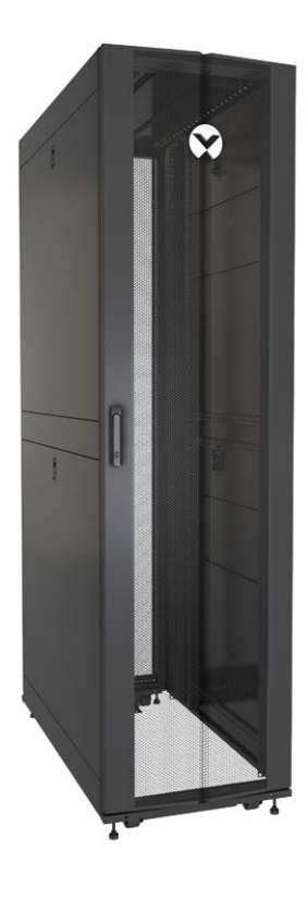
Vertiv™ VR RACK 48U 600W 1200 D Part #: VR3307

Vertiv<sup>™</sup> VR RACK 45U 600W 1200 D Part #: VR3305