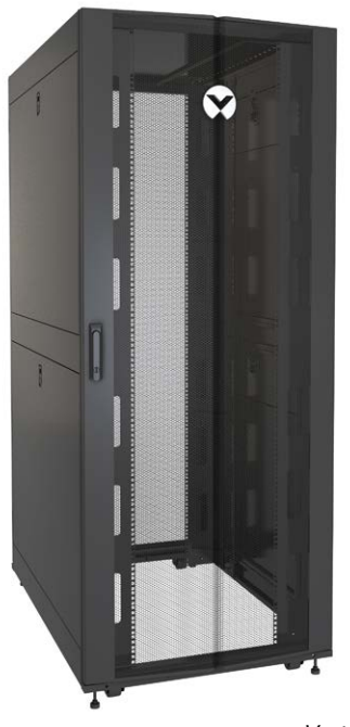
Vertiv<sup>™</sup> VR RACK 42U 800W 1200 D Part #: VR3350