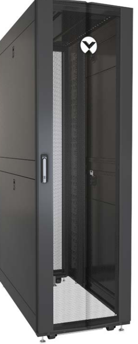
Vertiv™ VR RACK 42U 600W 1200 D Part #: VR3300