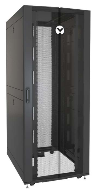
Vertiv™ VR RACK 42U 800W 1100 D Part #: VR3150

Vertiv™ VR RACK 42U 600W 1100 D Part #: VR3100