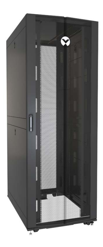
Vertiv<sup>™</sup> VR RACK 48U 800W 1200 D Part #: VR3357